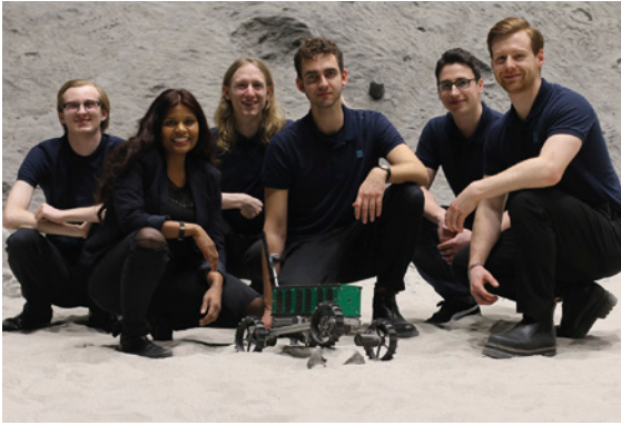
Neurospace team with their prototype of a new generation lunar rover