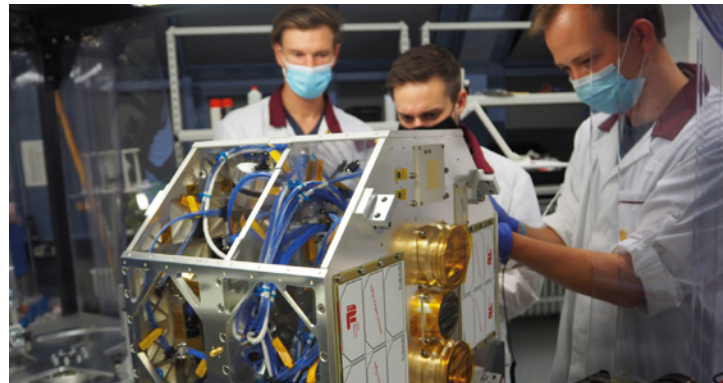
TU Berlin's microsatellite TUBIN was launched in June 2021 on a Falcon 9 rocket from SpaceX. Its mission is to observe large fires.

These include propulsion technology, lightweight components, electronics, optics, laser systems, power supply, measuring instruments, communications technology, sensors, simulation software, etc.