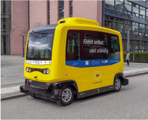
EasyMile driverless bus on the Charité campus