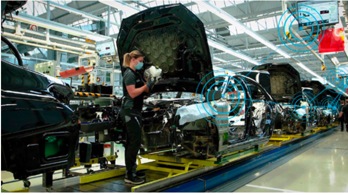
The focus of the Marienfelde site is on the development and implementation of MO360, the digital Mercedes-Benz production ecosystem.