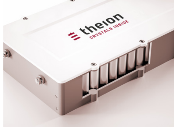
Theion plans to launch the first solid-state lithium-sulfur battery in 2023.