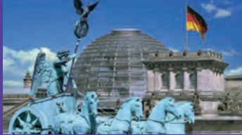
Quadriga in front of the Reichstag