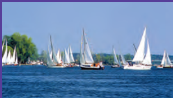
Excellent leisure opportunities in the region