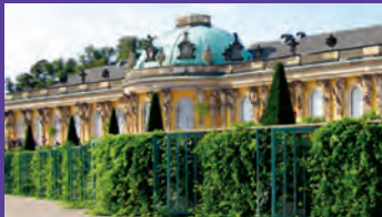
Sanssouci Palace in Potsdam